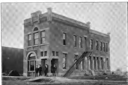
STATE BANK OF THOMPSON